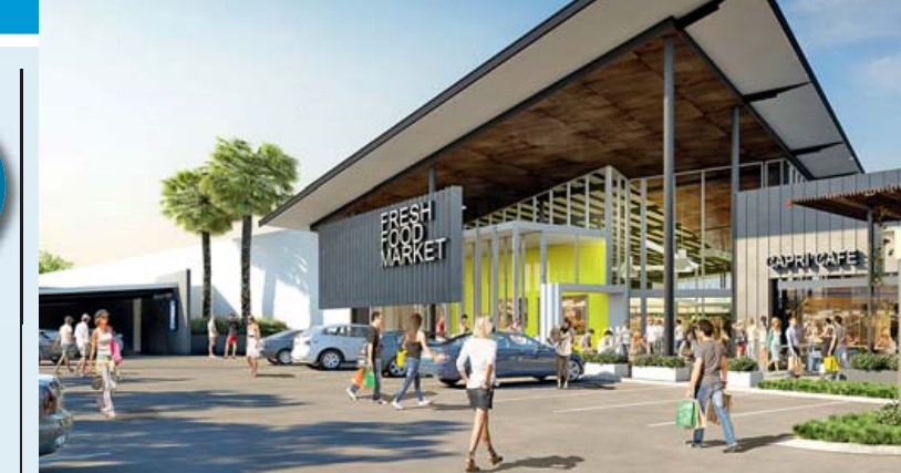
Stage two of the redevelopment of the Isle of Capri's commercial centre is