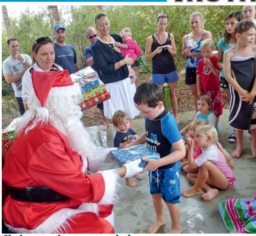
Christmas just around the corner When children queue up to meet Santa at Hutchies' Social Club Kids' Christmas Party, it's a sure sign the festive season is just around the corner. This year the kids met Santa at Dreamworld's White Water World on the Gold Coast where they gave Santa his shopping list before having a great time in the water. Hutchies' kids are pictured with Santa receiving early Christmas gifts.